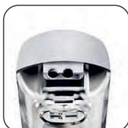
Cage clamp or Wieland connection